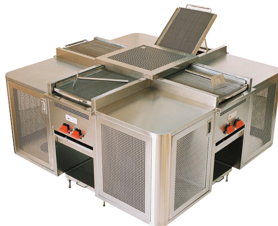
Custom made 4 Station Char Grill for Holiday-Inn