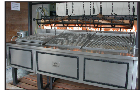
Parilla, Gas & Charcoal Fired