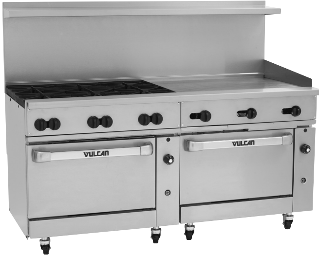
Model 72SC-6B-36G-N (shown with optional casters)